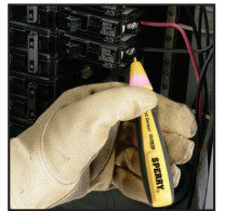
Simple One-Button Operation