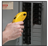
Auto Sensing Receiver