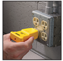
Plug Style Transmitter