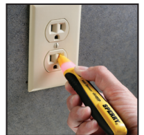
Audible and Visual Indication